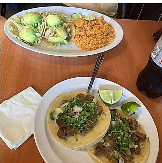
LUNCH, KENNETT STYLE.