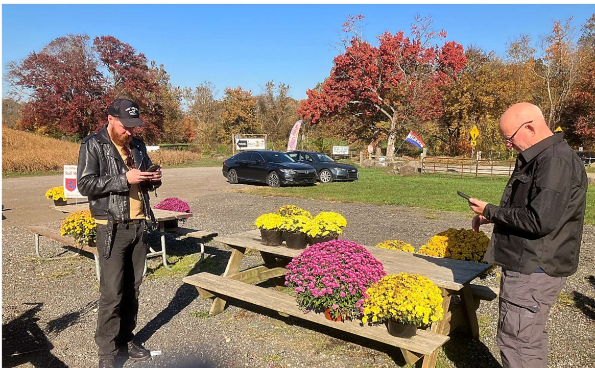
FIRST STOP: A FARM STAND NOT FAR FROM SMITH'S BRIDGE