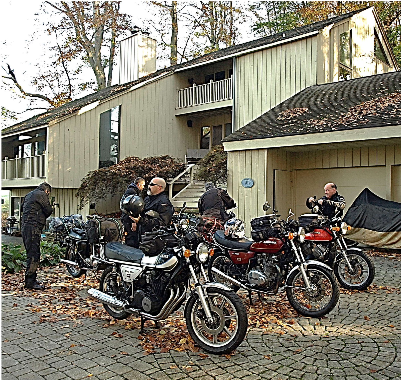
"I'M PUTTING ON MY HELMET" = TIME TO RIDE!