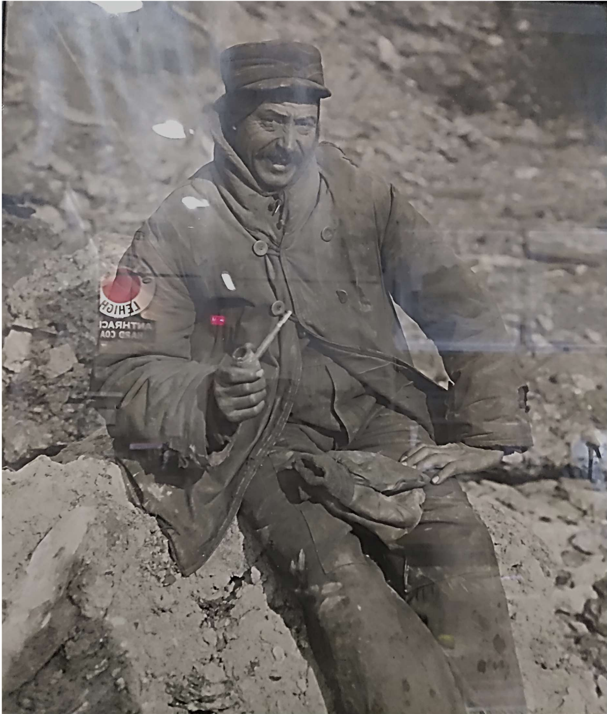
Not an easy way to make a living; those were real men!