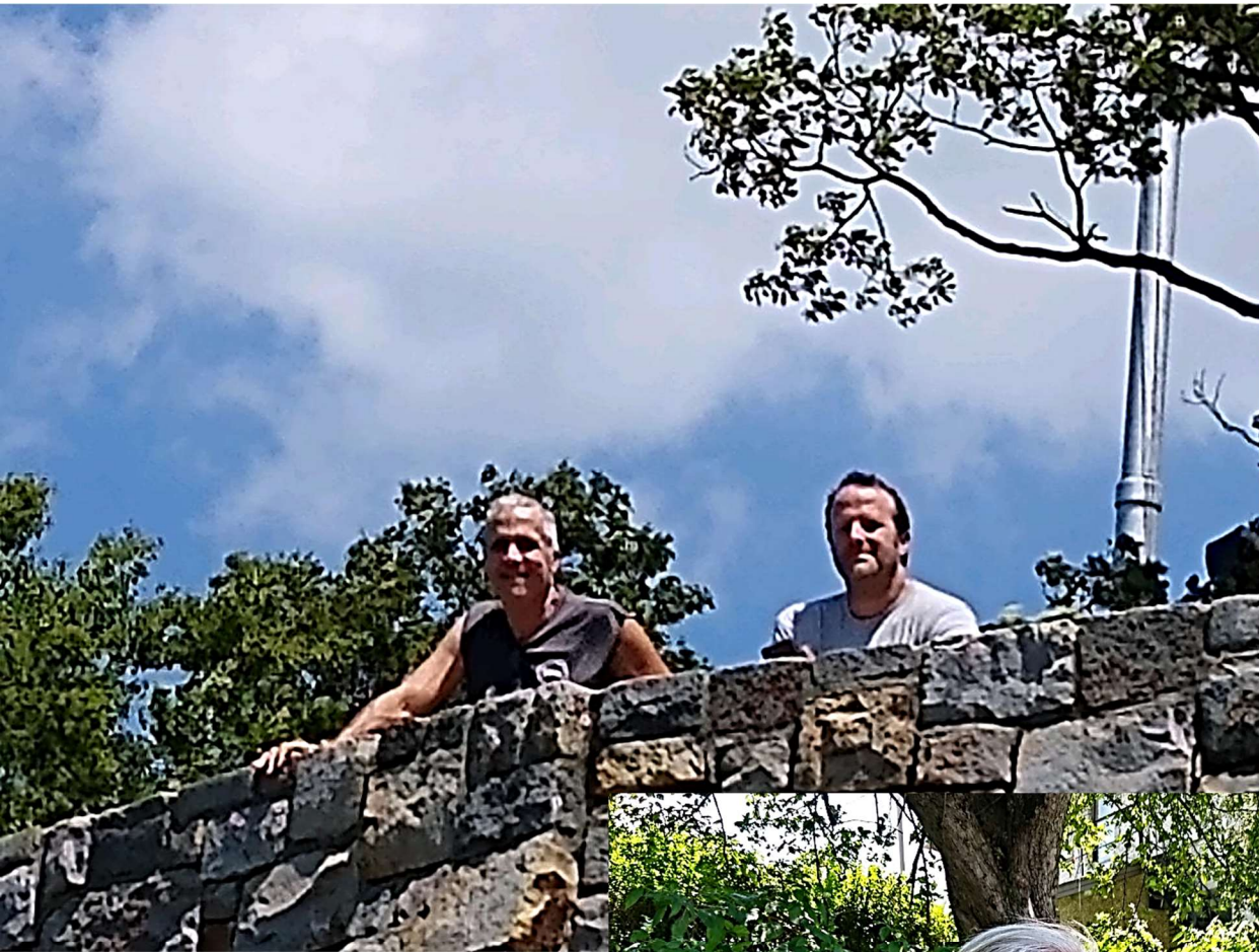
Father and son-in-law.