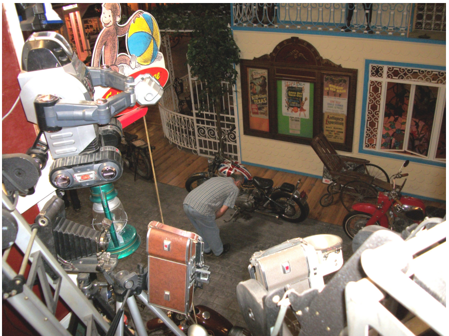
Brian admiring an old Brit bike, seen through robots and cameras.